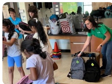
At the Troy Community Coalition we provided school supplies and fun financial education activities.