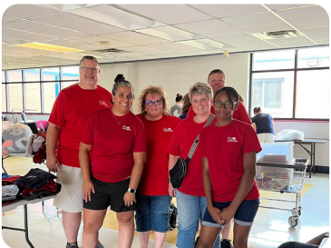
OUR Staff served at the Macomb Foster Closet this summer.