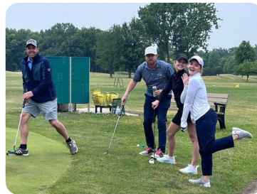
Putting Challenge fun at the 10th Annual Golf Outing. Thankful for our golfers!