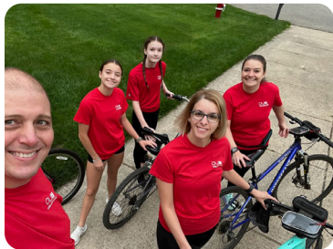
Staff families and friends participated in Ride 2 End Suicide.