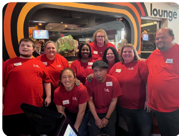
OUR Staff had a ball at Bowling with a Buddy for Children's Miracle League.