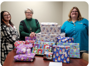
Adopt-a-Family: Branch and department teams work together to choose an organization and shop for families in need. Staff generously pitch in additional funds to make sure these families have a memorable holiday.